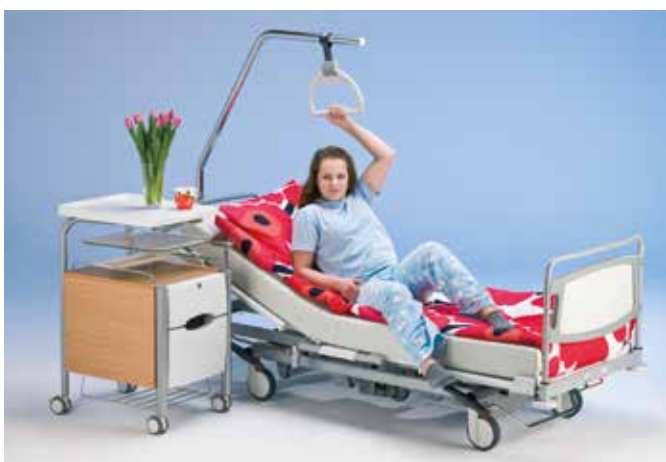
Correct and variable treatment positions are crucial for patient comfort, and they are easy to carry out with the four-part bed section. Climbing in and out of bed has been made easy for the patients.