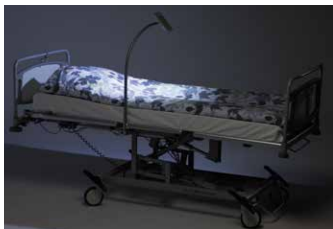
The optional patient panel can be used as a handy reading light. Bed in picture is Futura Plus, the control panel and light is the same as in Carena (not designed for washing)