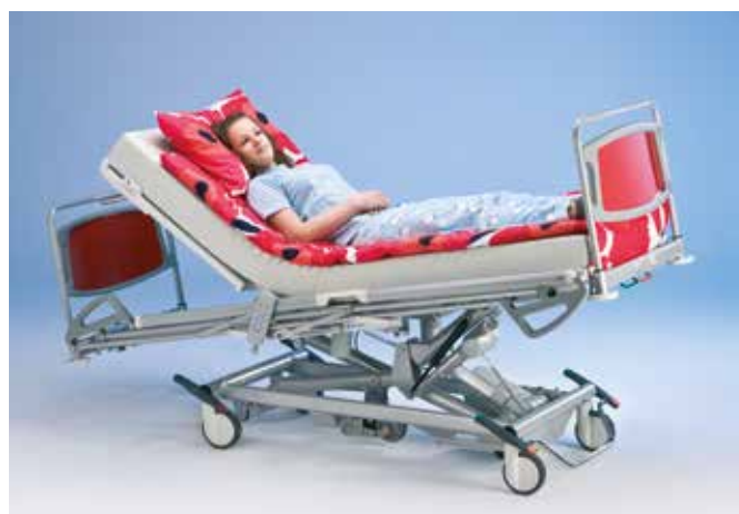
The Trendelenburg position is often used to support postural care. The vertical raising motion does not require additional space, which means the position can be changed, even in tight surroundings. The unique lifting mechanism has been patented.