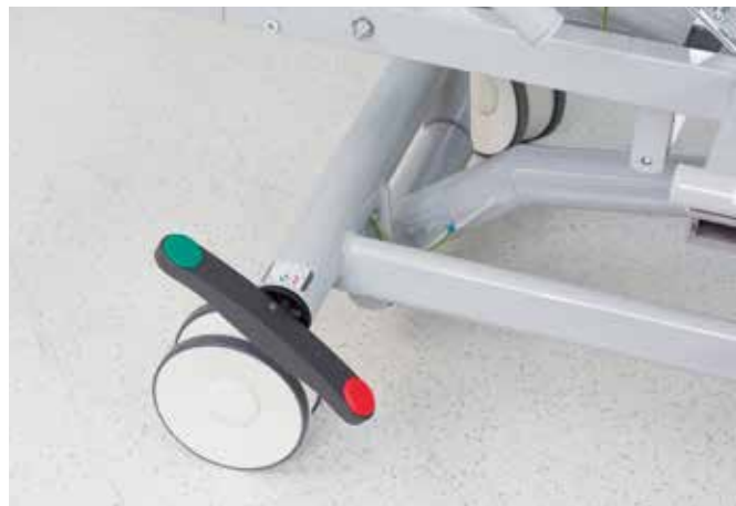
The design of the brake pedal facilitates the locking and releasing of the brake. The dual castors make the bed easy to manoeuvre.